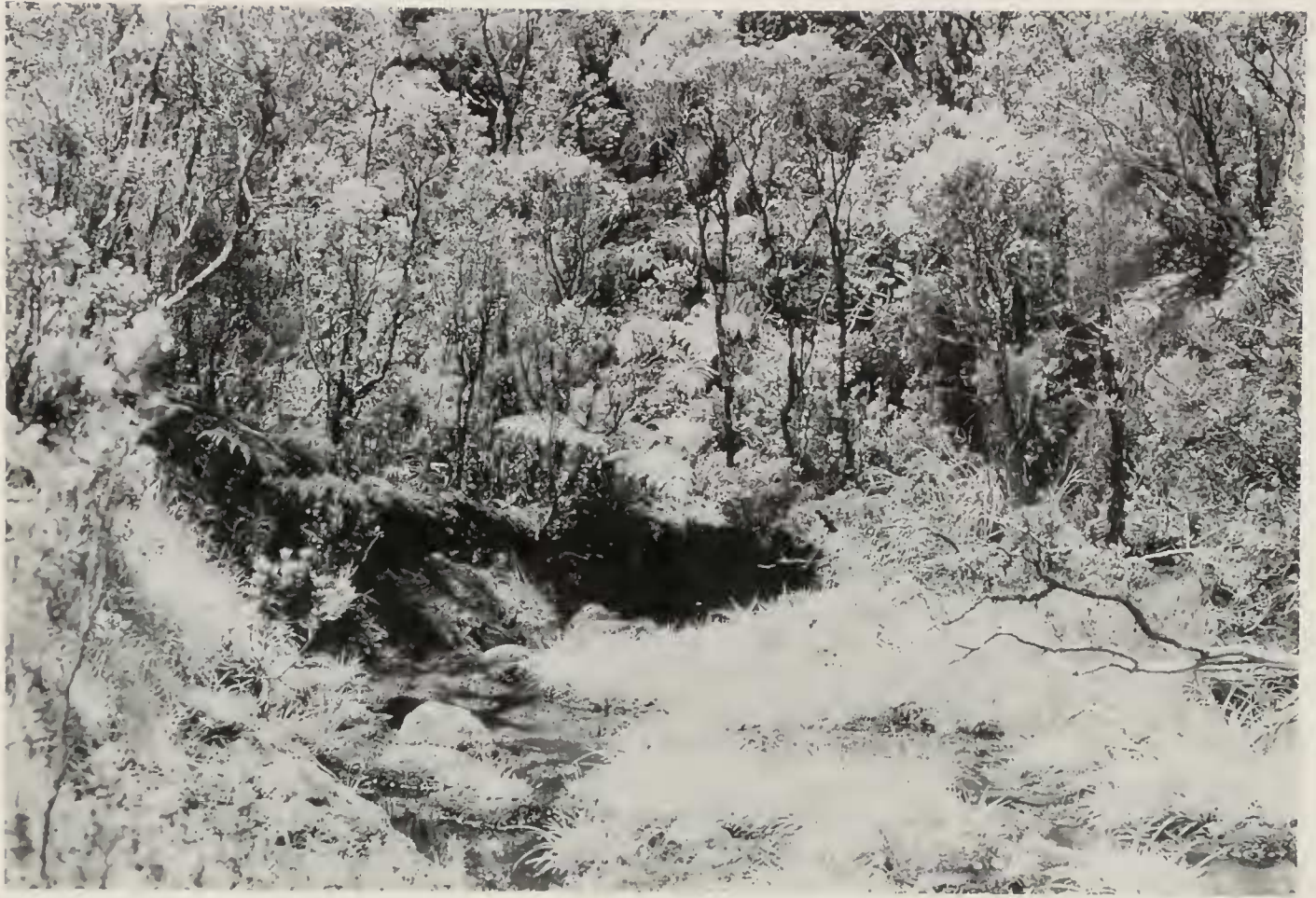
FIG. 4. An open area of stream bed on Halehaha Stream where HDP flushed a Puaiohi.

of intense observation and possible recovery actions by federal agencies and The Peregrine Fund. These ongoing studies have already discovered a larger than expected population (Pyle 1996) in the Koai'e Stream area (almost directly between Koke'e and our 1975 study site) where two nests were found about a decade ago (Ashman et al. 1984, Kepler and Kepler 1983).